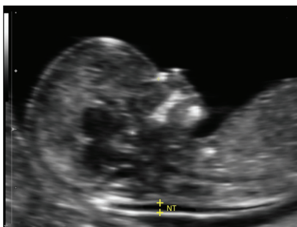
Figure 1. Normal nuchal translucency thickness (NT)

Nuchal translucency (NT) is the assessment of the amount of fluid behind the neck of the fetus, also known as the nuchal fold. An anechoic space is visible and measurable sonographically in all fetuses between the 11th and the 14th week of the pregnancy (Figure 1). Underlying pathophysiological mechanisms for nuchal fluid collection under the skin include cardiac dysfunction, venous congestion in the head and neck, altered composition of the extracellular matrix, failure of lymphatic drainage, fetal anemia or hypoproteinemia and congenital infection [1]. The abnormal accumulation of nuchal fluid decreases after the 14th week.