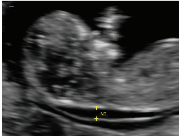
Figure 2. Increased nuchal translucency thickness (NT)

The association between the increased NT and the chromosomal abnormalities has been well documented (Figure 2). It helps us identify the high-risk fetuses for trisomy 21 and other chromosomal abnormalities [2,3].